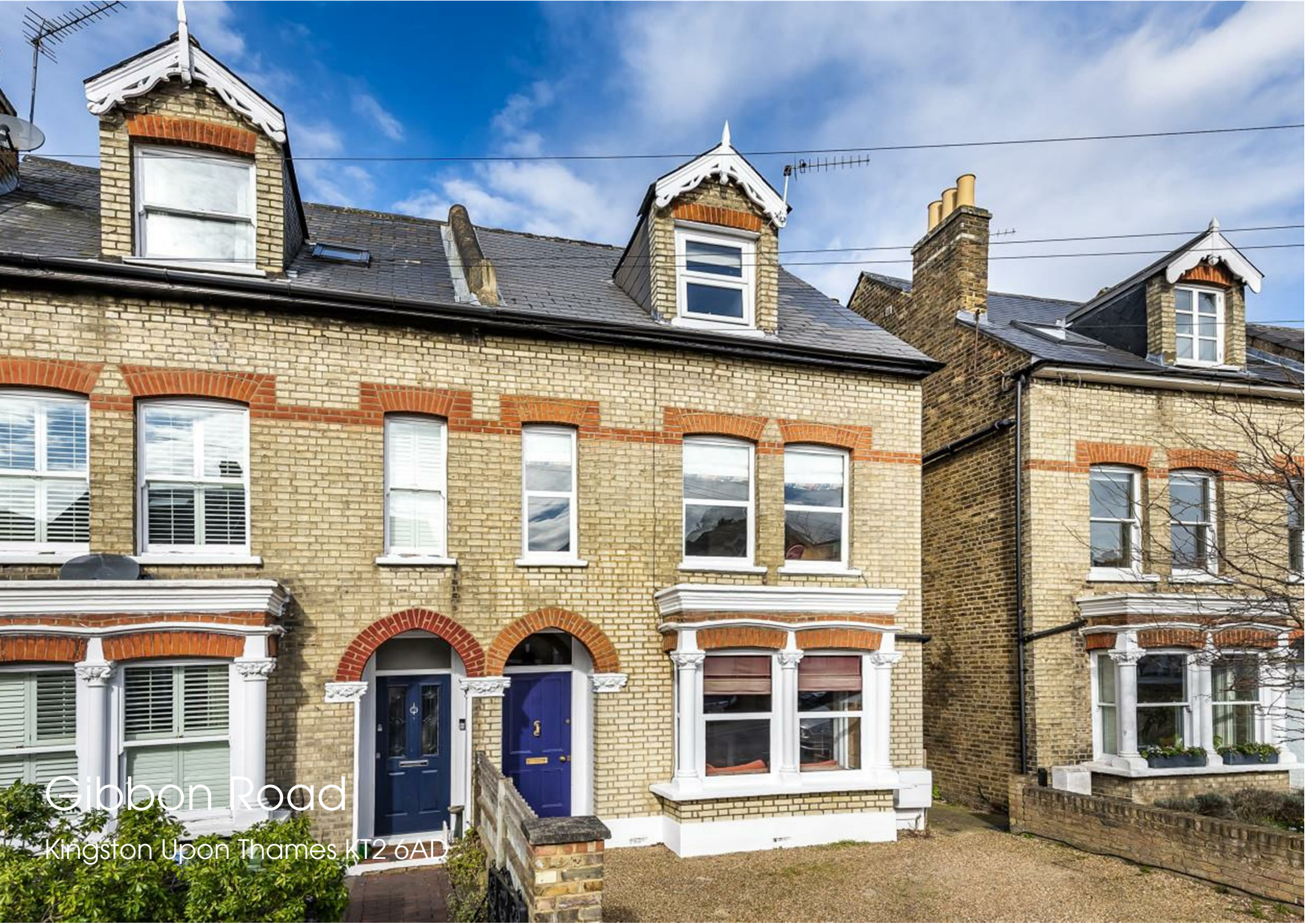
Gibbon Road Kingston Upon Thames KT2 6AD